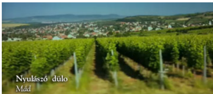
Nyulászó dűlő Mád

Tokaj's vineyards were the first ever to be formally classified. Already in the mid-17th century the Rákóczi family introduced 1st, 2nd and 3rd class (or cru) quality ratings - more than 150 years before the Bordeaux classification. Today, more and more wineries produce growth-selected wines. A good reason for us, to introduce some famous Tokaji vineyards to you.