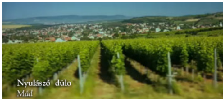
Nyulászó dűlő Mád

Tokaj's vineyards were the first ever to be formally classified. Already in the mid-17th century the Rákóczi family introduced 1st, 2nd and 3rd class (or cru) quality ratings - more than 150 years before the Bordeaux classification. Today, more and more wineries produce growth-selected wines. A good reason for us, to introduce some famous Tokaji vineyards to you.