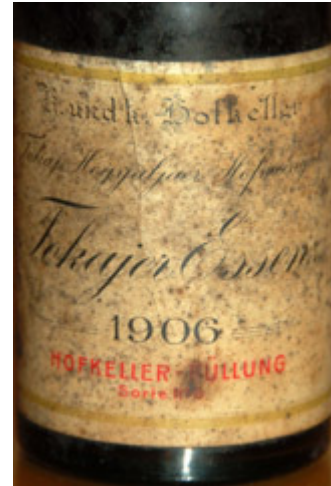
photo: 1906 Tokajer Essenz from the cellar of the Vienna Hofburg

been impossible then to get the Emperor's signature ...