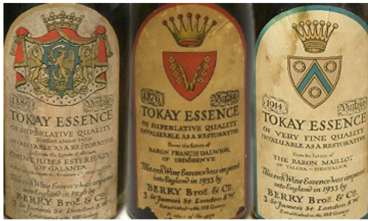
1889 Tokay Essence from the Estate of Count Esterhazy